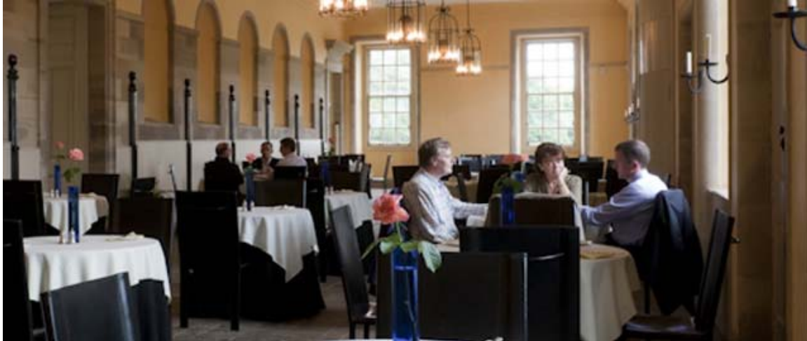
table that we sat at. Eat your heart out! We had scones, cream, champagne and strawberry jam.

We had afternoon tea in what were the stables. The three persons are sitting at the same